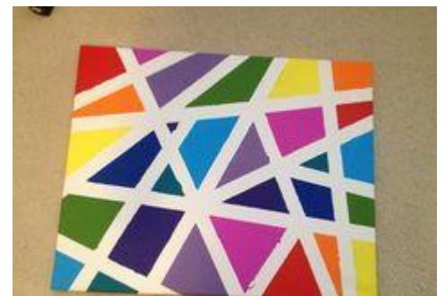
Option 3: Preschool Tape and Paint